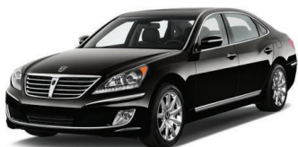
Hyundai Centennial (Limousine)